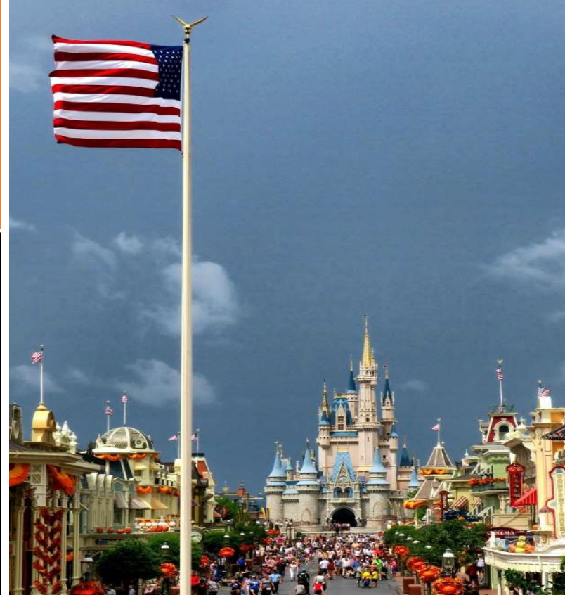
Photo right: Disney is keeping both its magic and its patriotism alive while the parks are closed due to the COVID-19 outbreak

"You do not see this enough with big corporations. Thank you Disney and God bless America," a fan commented.