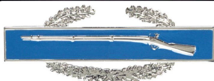
The Combat Infantry Badge

Obama removed the question b/c he wanted to "transform" America.