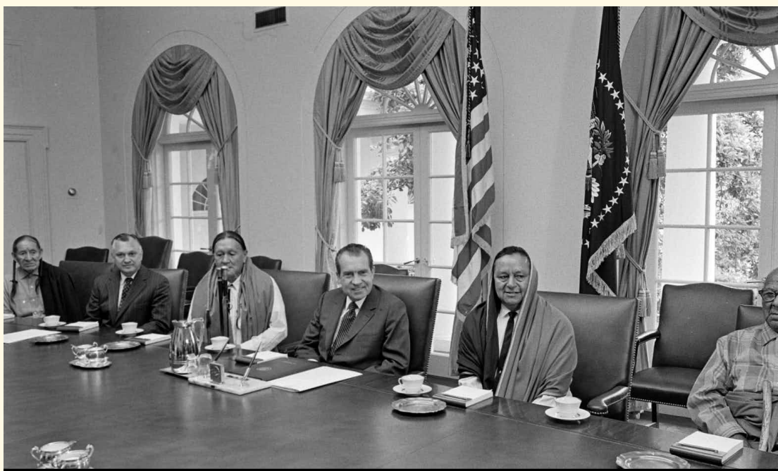
President Nixon meeting with leaders from Taos Pueblo and the administration.