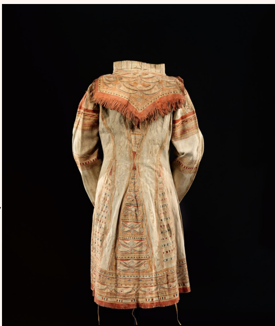
Man's coat, 1820 Innu, Diker Collection

A major gift from Charles and Valerie Diker in 2017 of 91 works of Native American art — masterworks from the collection they assembled over more than four decades, and another 20 works already given during the past two decades — have solidified its collection base.