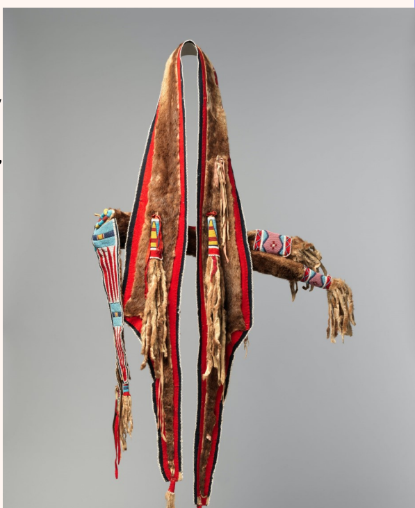
Bow case and quiver, Nex Perce, 1870, Diker Collection