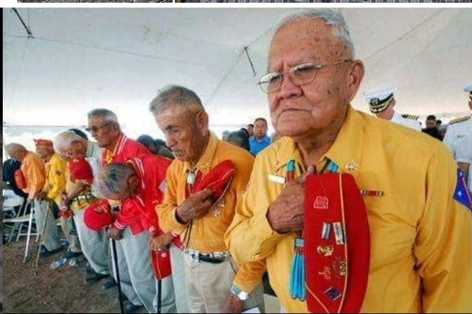
Navajo Code Talkers stand for the National Anthem

"I am bringing a distant nation against you. An ancient and enduring nation. A people whose language you do not know, whose speech you do not understand."