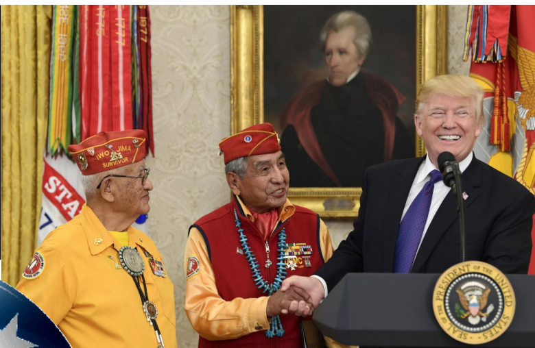
Photo below is a Navajo Code Talker and photos of him that appear on the cover of many books.