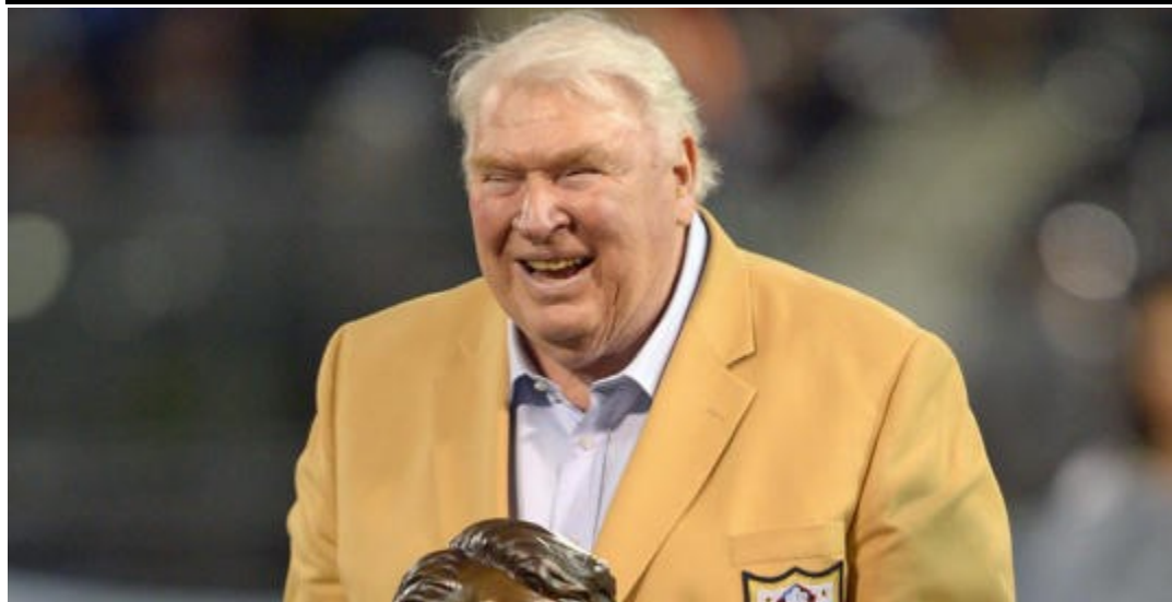
Icon, John Madden's death at 85

However, if the home is on the market with "Help U Sell" or "By Owner" the seller and buyer may interact.)