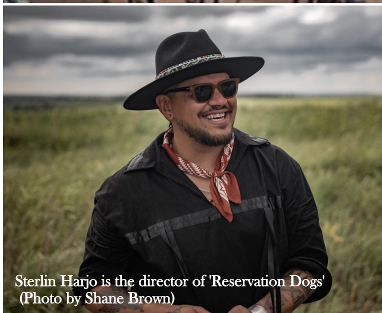
Sterlin Harjo is the director of 'Reservation Dogs'